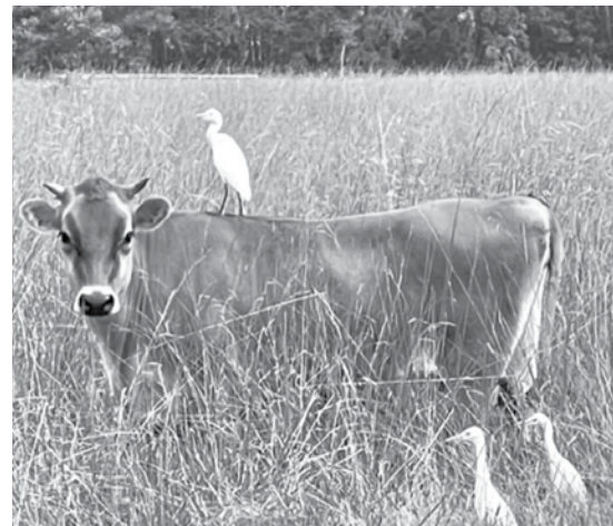
When cattle graze through the fields of Wadmalaw Island, cattle egrets, a small species of the heron family, are often found in their company. The birds are attracted to the insects that the cows and other large animals stir up as they move about the pastures.

keepwadmalawbeautiful@gmail.com or text 843-566-5702