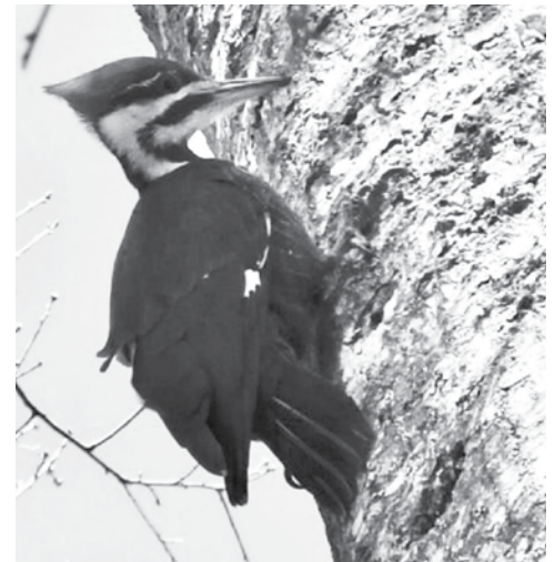
The Pileated Woodpecker is the largest woodpecker in North America...and loves calling Wadmalaw home.