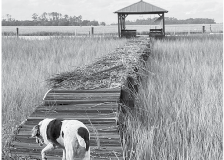
Tropical Storm Idalia brought high winds and high tides to Wadmalaw.