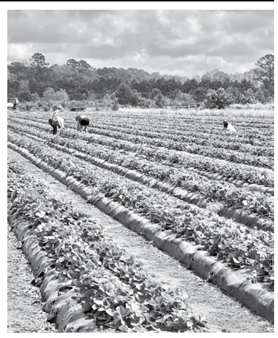
Strawberry picking time on Wadmalaw Island!

State: Days before the trial contesting the issuance of the SCDHEC-OCRM state "Critical Area" permit, also granted last March, the appeal was "settled" by attorneys for Point Farm, SCELP (SC Environmental Law Project), and OCRM. That permit allows the excavation of the salt marsh and ponds that will physically create the mitigation bank. Unfortunately, the settlement agreement did away with a sediment analysis of the old farm detention ponds that, on appeal, the DHEC Board required as part of the permit. The analysis would have determined if any toxic fertilizers, herbicides, or pesticides exist as